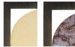
Bronze with hand-gilded gold discs