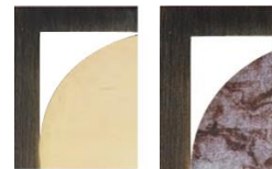
Bronze with hand-gilded gold discs